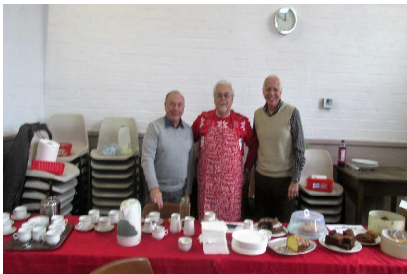
The Craft Fayre at the Village Hall on the 26 th November was very well attended and a great success. Hopefully it will become a regular event.