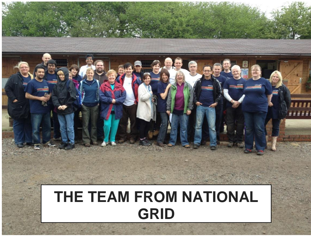
THE TEAM FROM NATIONAL GRID

There were a lot of exhausted people with aching muscles following a National Grid Team Challenge day at Newlands Bishop Farm in Berry Hall Lane on the 10 th May. The Family Care Trust is their Charity for the Year and the Metering Change Management team from National Grid, Solihull went along to support the initiative.