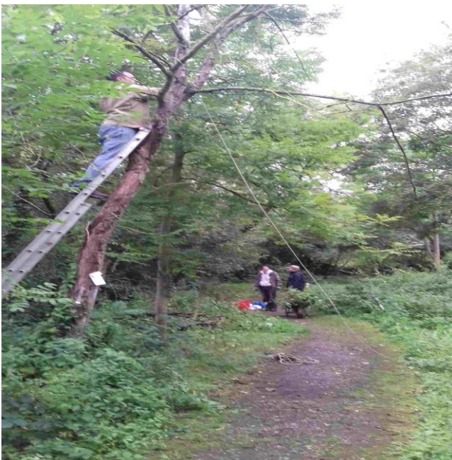
Sunday morning work on the common and Meadow Cranesbill in flower.