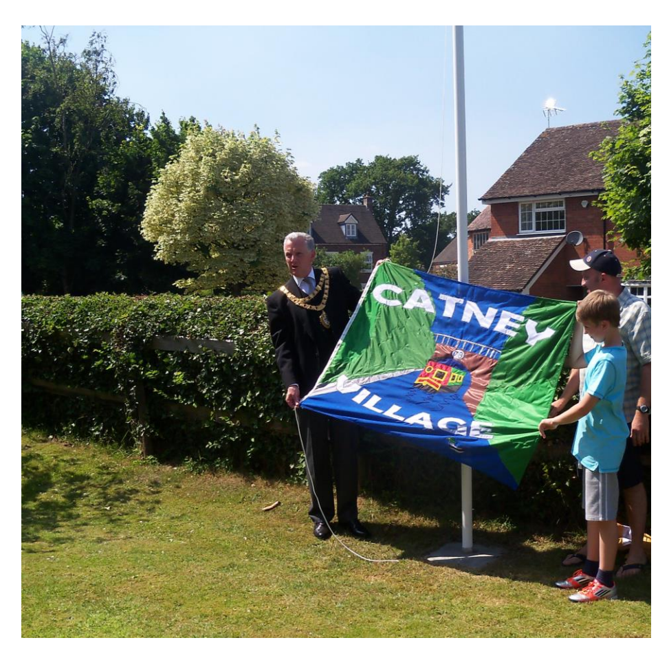
Remember this? The young man on the right designed the flag.