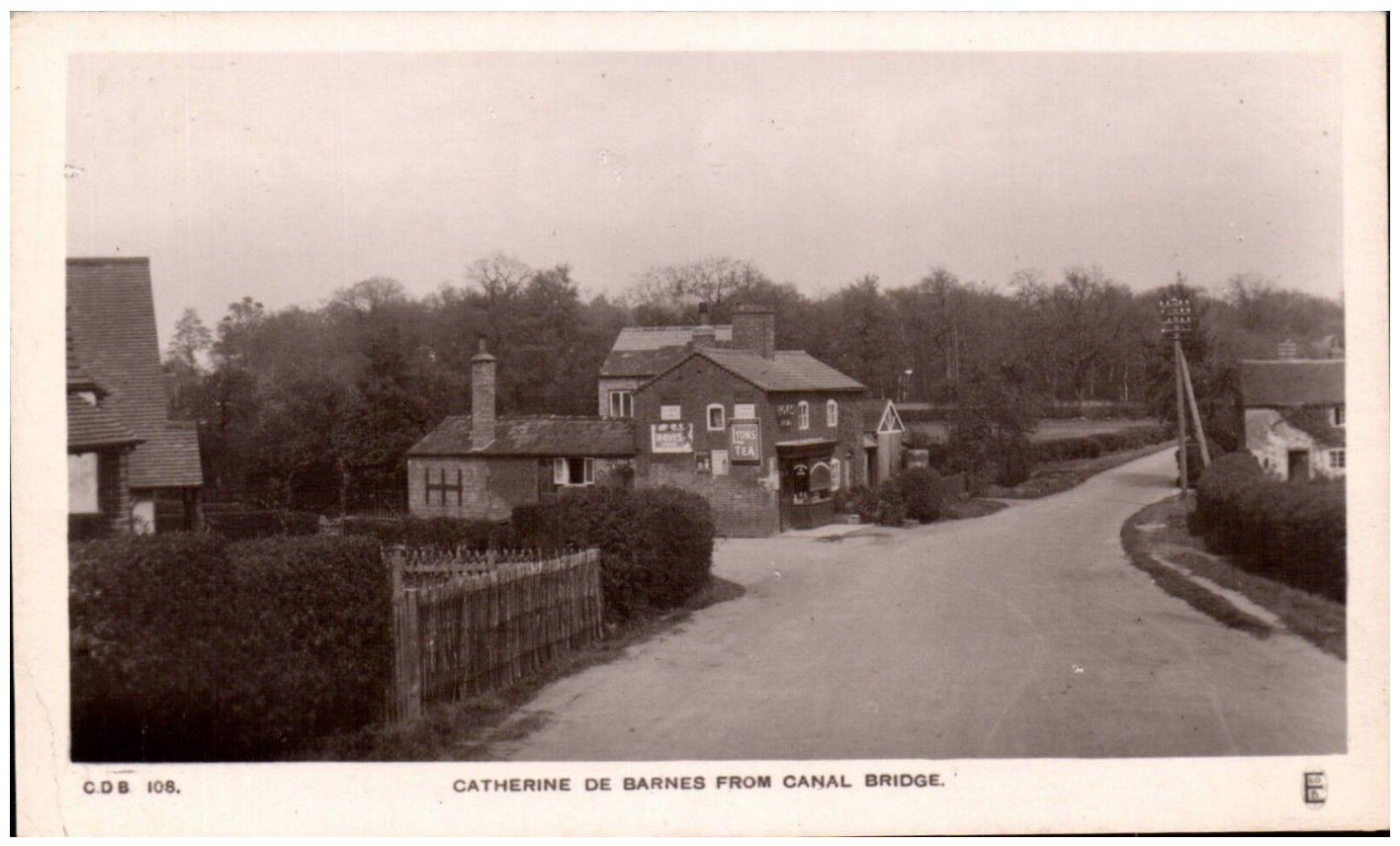
This shows the bakery. They used flour produced by the mill at the ford in Henwood Lane.