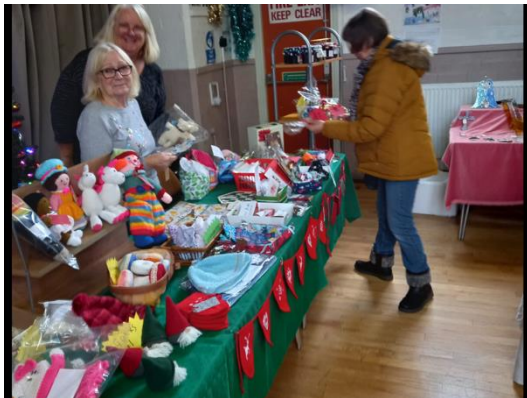
Craft Club Table.