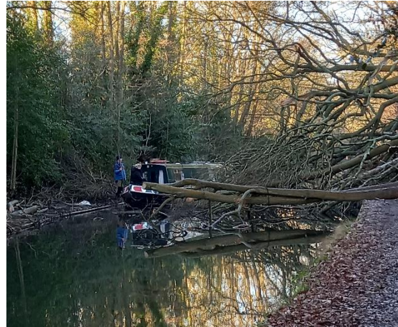
Hire cruiser that got stuck

All of that drama is now in the past as the Canal and River Trust organised some contractors to deal with the problem and in the first week of January the footpath at the top of the canal bank was closed off and a JCB and a tractor came into the wood by driving across a field and into the wood. They then started at the top and pulled all of the trees up the bank, clearing the footpath, the canal bank, the towpath and the canal in one busy day.