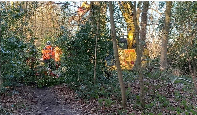
JCB and contractors in the wood.

All of that drama is now in the past as the Canal and River Trust organised some contractors to deal with the problem and in the first week of January the footpath at the top of the canal bank was closed off and a JCB and a tractor came into the wood by driving across a field and into the wood. They then started at the top and pulled all of the trees up the bank, clearing the footpath, the canal bank, the towpath and the canal in one busy day.