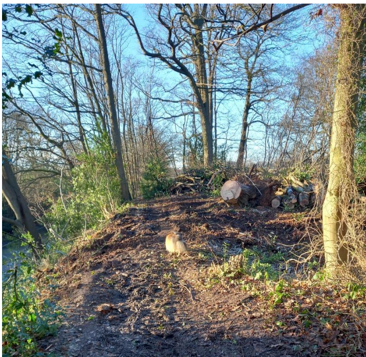
Path, looking towards the field