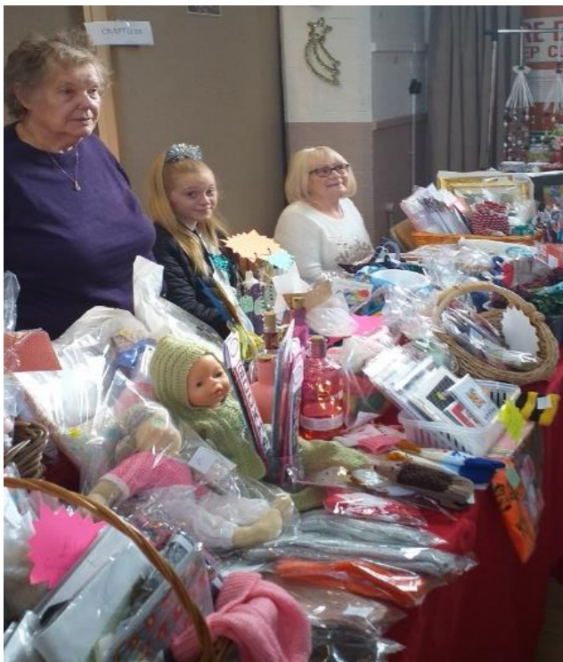
A view of the craft club table from 2019

Currently the plans are to have a craft fair in the village hall as we have done in previous years. 2020 had to be cancelled as the pandemic rules did not allow gatherings in enclosed spaces. We don't know what the situation will be this winter, but by then we will have a fully vaccinated population and a clearer idea of the importance of all the emerging variants. There will be a background circulation of this virus and we may have to have regular winter vaccinations against the latest strains, a bit like we have with influenza each autumn.