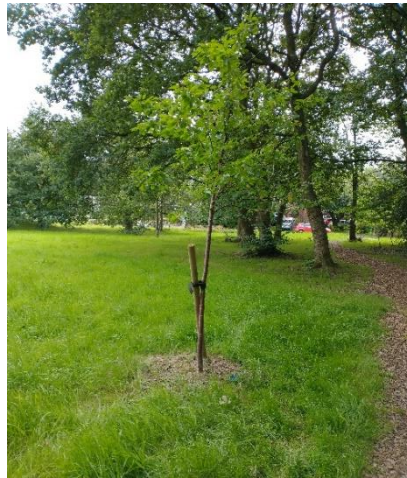
New Cherry tree

The wild cherry which was planted last year seems to be doing well and fortunately it avoided the floods of last winter. In late July the common was mown by the team from Newlands Bishop farm. We shall have a work party in August to attack some of the nettles and brambles along the pathway and to remove the markers around the wildflower areas and generally tidy up. Most of the flowers have now seeded and the areas will be cut next time, hoping they come back in the spring.